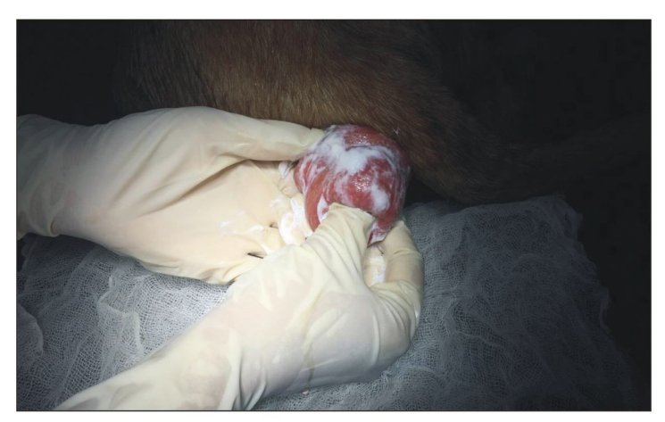
Fig. 1. Repositioning of the prolapsed mass