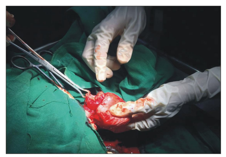
Fig. 2. Excision of prolapsed mass