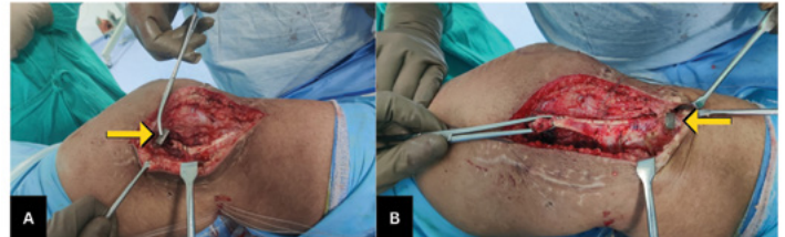
03-A Previous lax ligament along with loose bone staple on the femoral side. 03-B Previous tibial side bone staple along with ligamentized graft.

We decided to revise the medial side reconstruction with a single femoral tunnel and two tibial tunnels (one each for the sMCL and the POL) along with augmentation of the grafts with menisco-capsular sutures.