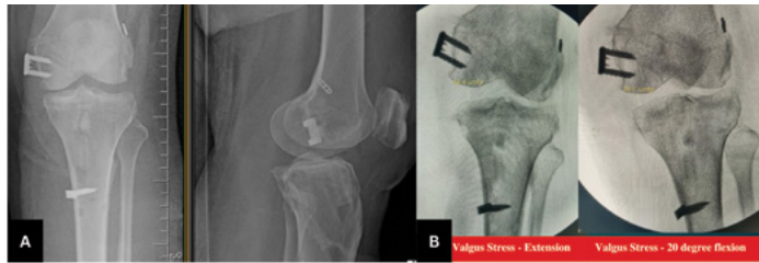
01-A Pre-operative x-ray of the left knee – Bone staples over MCL attachments & previous tunnels for ACL and PCL. 01-B Valgus stress views showing >10 mm medial side opening.