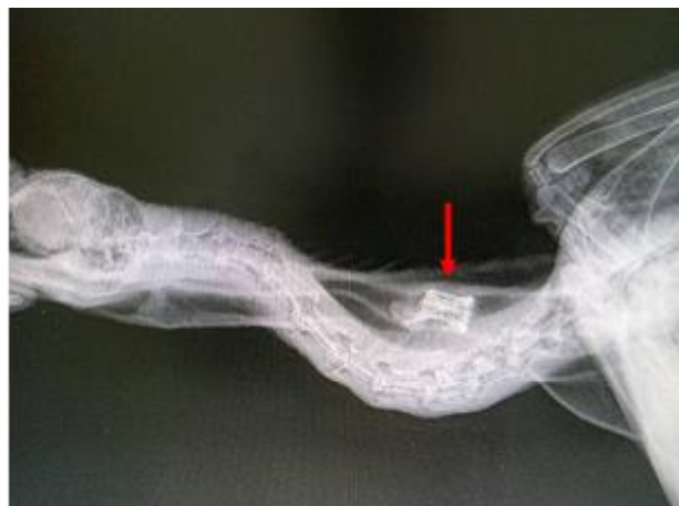
Fig. 1: Radio-opaque foreign body with sharp projections resembling fish bone (arrow) in the distal part of cervical esophagus

surgery department with a history of swelling in the neck and subsequent anorexia for 24 h but normal water intake. Clinical examination revealed the presence of an unusual swelling at the base of the neck. The swelling was hard and with sharp edges. Radiological examination revealed the presence of a large fish bone with sharp projections in the distal third of the neck (Fig. 1).