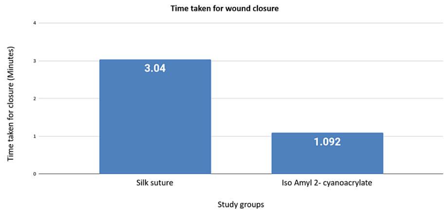
FIGURE 3: Graphical representation of the mean time taken in minutes between the silk suture group and the IAC group