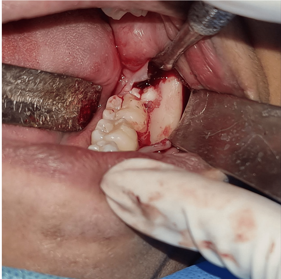
FIGURE 1: Intraoperative picture

This prospective clinical study was done on intra-oral surgical procedures (Figure 1) to evaluate the clinical effectiveness of IAC in the closure of intra-oral incisions when compared with 3-0 silk sutures (Figure 2).