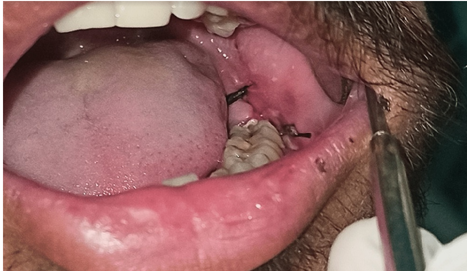
FIGURE 2: Intraoperative picture showing silk sutures

Intraoperative picture of the surgical site closed with 3-0 silk sutures.