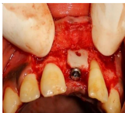
Fig. 11 Implant placed