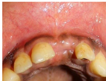
Fig. 8 Post operative 6 months view showing gain in ridge width