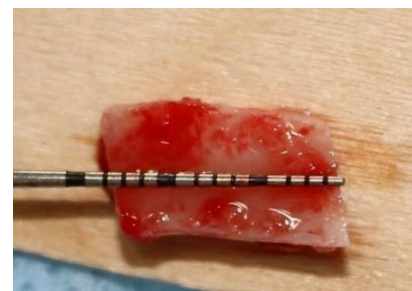
Fig. 5 Dimensions of the harvested block graft