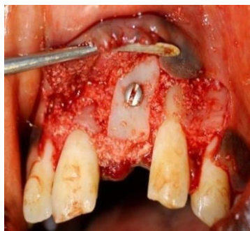
Fig. 7 Graft secured with screws