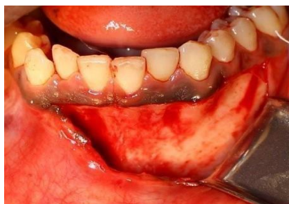
Fig. 3 Donor site flap reflection