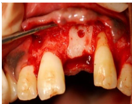
Fig. 9 Surgical site re entered and fixation screw removed