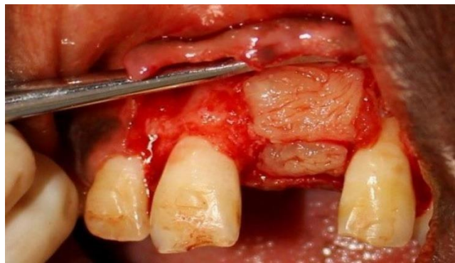
Fig. 12 Bone graft and PRF