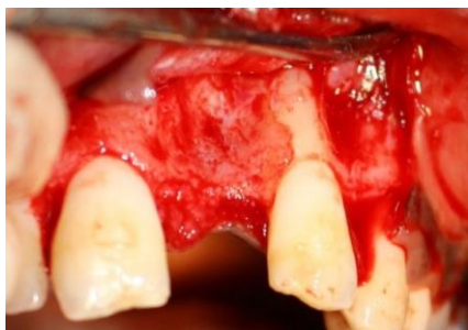
Fig. 6 Receptient site flap reflection