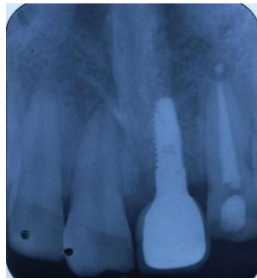
Fig.13,14 Clinical and radiographic image after crown placement

The surgical site was re entered after 6 months for implant placement (Fig.8 ). Local anaesthesia was given and a mid crestal and two releasing incisions were given to expose the surgical site. There was minimal resorption around the graft and the post surgical alveolar width was measured to be 4.5mm. The stabilizing screw was removed and the graft had good stability. A 3.3 X 13 mm Global Medical Implants (GMI) implant was planned for the site and hence a ridge split had to be carried out. The implant was placed with good initial stability. Osseo graft was used to cover the screw hole and a platelet rich fibrin (PRF) membrane was placed. The surgical site was closed with 3-0 silk. Post operative antibiotics and analgesics were given (Fig.9 to 12). Second stage surgery was carried out after 6 months and healing abutment was placed. 2 weeks later impressions were taken and the implant crown was made (Fig. 13,14).