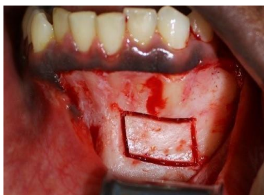
Fig. 4 Donor site outlined for block graft harvesting