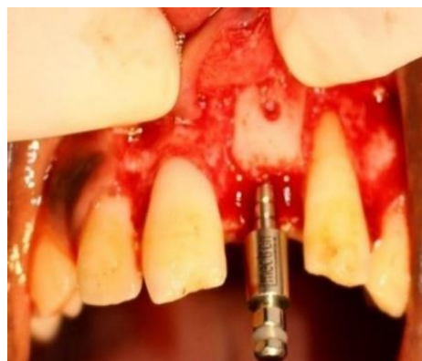
Fig. 10 Ridge expansion